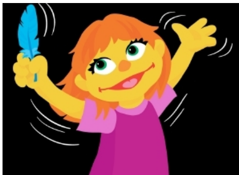
Welcome Julia to the Sesame Street Family! Julia is a new Muppet character with autism.

must have an ASD (or ABS) licensed teacher on his/her team. This teacher must be involved in the evaluation/reevaluation process and be in attendance at the IEP meetings.